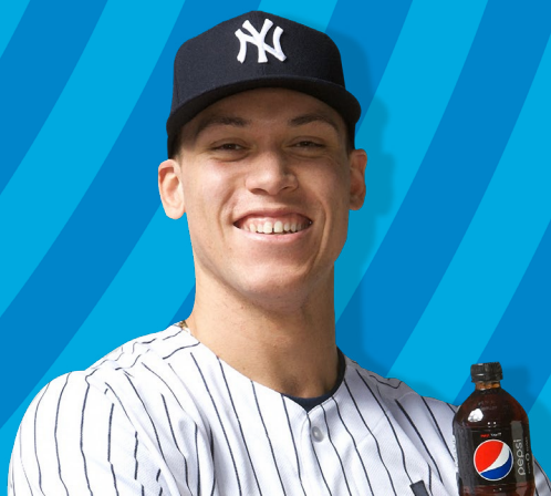
Aaron Judge MLB Right Fielder