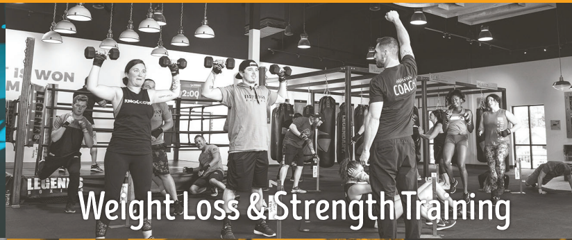
Weight Loss & Strength Training