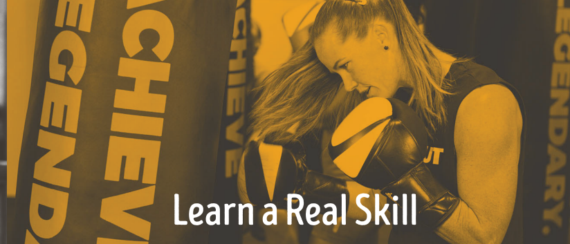
Learn a Real Skill