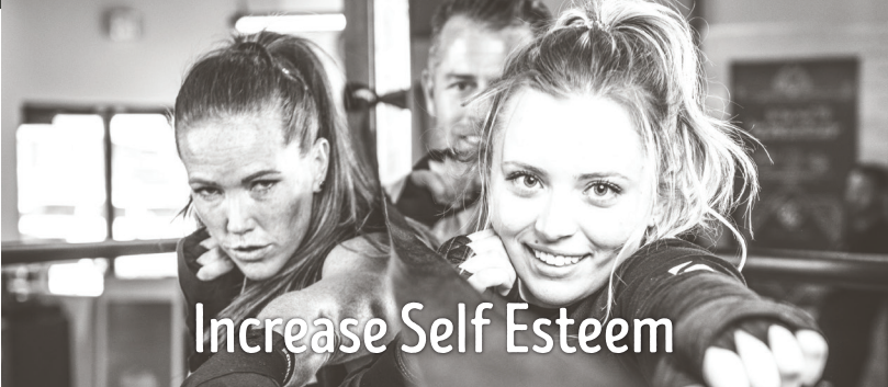
Increase Self Esteem